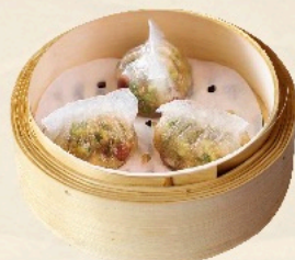
潮州粉果 Steamed Pork & Radish Dumplings £6.20

Photo illustrations are for reference only. All prices are inclusive of VAT. A discretionary service charge of 12.5% will be added to your bill.