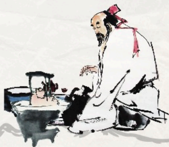
Photo illustrations are for reference only. All prices are inclusive of VAT. A discretionary service charge of 12.5% will be added to your bill.