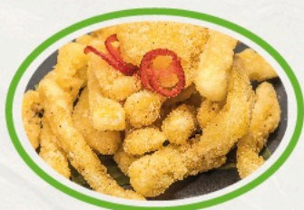
酥炸鮮魷 Crispy Fried Shredded Squid £7.10