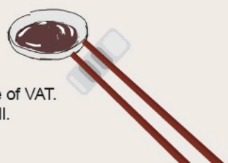
Photo illustrations are for reference only. All prices are inclusive of VAT. A discretionary service charge of 12.5% will be added to your bill.