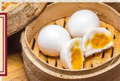
Steamed or Deep Fried Cream Custard Buns £5.50