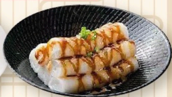
港式碎仔腸 Plain Cheong Fun with Peanut Sauce (M) £6.30