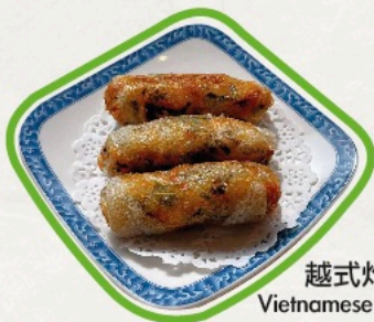
越式炸春卷 Vietnamese Spring Roll £6.10

Photo illustrations are for reference only. All prices are inclusive of VAT. A discretionary service charge of 12.5% will be added to your bill.