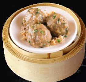
山竹牛肉球 Beef Meat Balls with Beancurd Skin £6.20