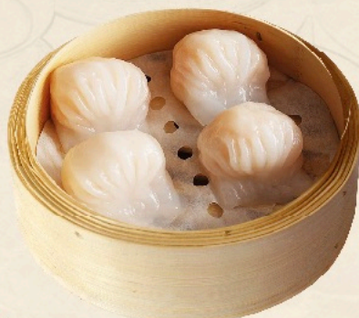
晶瑩蝦餃 Crystal Prawn Dumplings £6.20