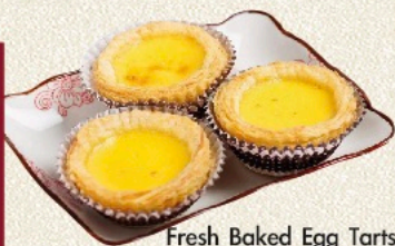
Fresh Baked Egg Tarts £5.50