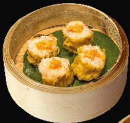
干蒸燒賣 Pork and Prawns Siu Mai £6.10