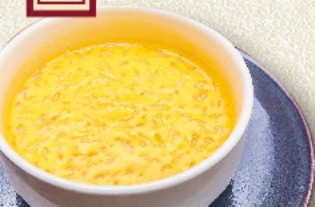
Fresh Mango and Grapefruit Tapioca £6.10