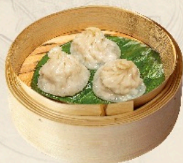
上海小籠包 Steamed Pork Dumplings Shanghai Style £6.10