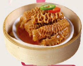
沙爹金錢肚 Steamed Beef Tripe in Satay Sauce £6.10