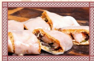
腐皮蝦腸粉 Crispy Beancurd Skin Prawn Cheong Fun £7.20