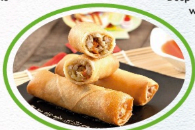
五香春卷 Deep Fried Prawn & Pork Spring Rolls £6.20