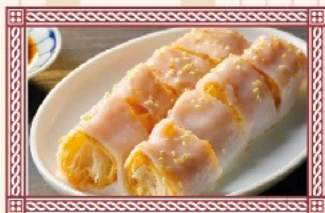
蔥花炸兩 Deep Fried Dough Cheong Fun (M) £6.30