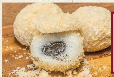
Black Sesame Glutinous Rice Balls £6.10