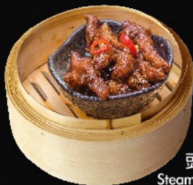
豉汁蒸鳳爪 Steamed Chicken Feet in Black Bean Sauce £6.10