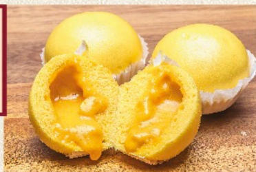
Flowing Custard with Salted Egg Yolk Buns £6.20