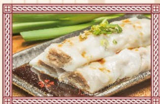
牛肉腸粉 Beef Cheong Fun £6.30