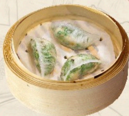
鮮蝦韭菜餃 Prawn and Chives Dumplings £6.20