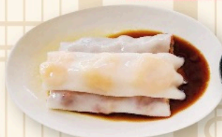
三式腸粉 Mixed Cheong Fun £7.20