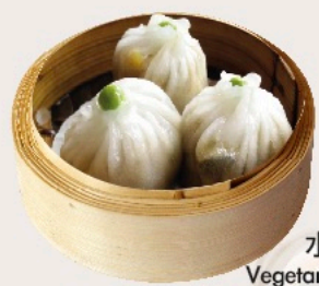
水晶羅漢餃 Vegetarian Dumplings (V) £6.10