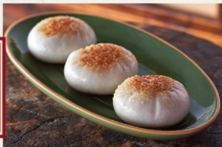
Pan-fried Pork & Vegetables Buns £6.10