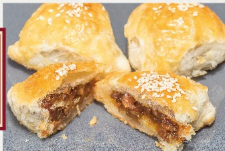
Honey Roasted Pork Puffs £5.50