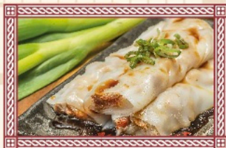
叉燒腸粉 BBQ Pork Cheong Fun £6.30