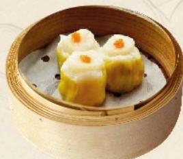
鮮蝦帶子燒賣 Scallop and Prawn Siu Mai £6.20