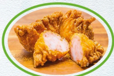
沙律明蝦角 Deep Fried Prawn Dumplings with Salad Dressing £6.10