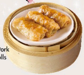
蠔皇鮮竹卷 Stuffed Prawn & Pork Beancurd Skin Rolls £6.20