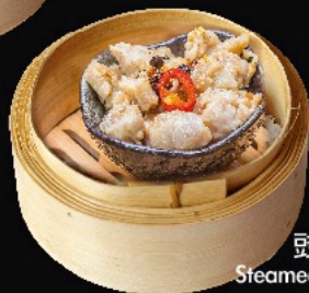
豉汁蒸排骨 Steamed Pork Spare Ribs in Black Bean Sauce £5.50