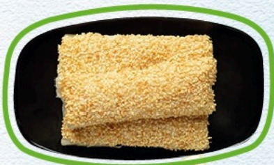
威化紙包蝦 Deep Fried Sesame Prawn Rolls £6.20