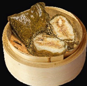
八珍糯米雞 Glutinous Chicken Rice in Lotus Leaves £6.20