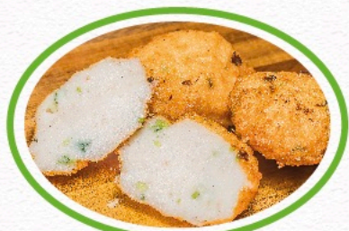
香茜墨魚餅 Fried Squid Cake £6.10