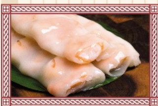
鮮蝦腸粉 Prawn Cheong Fun £7.20