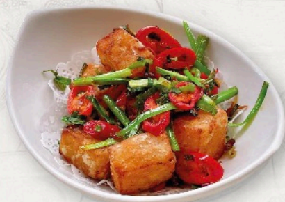
Stir Fried Turnip Cakes with X.O Sauce 🌶️ £7.80