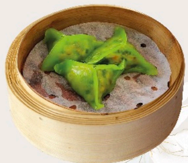
鮮蝦菠菜餃 Steamed Spinach and Prawn Dumplings £6.20