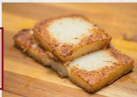
Grilled Turnip Cakes £5.50