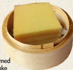
Malay Steamed Sponge Cake £6.50