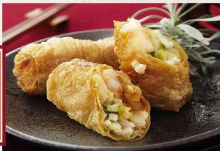
Crispy Beancurd Skin Prawn Rolls £6.20