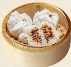
蠔皇叉燒包 Steamed BBQ Roast Pork Buns £5.50