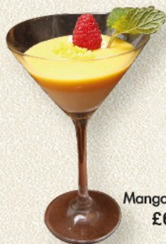
Mango Pudding £6.10